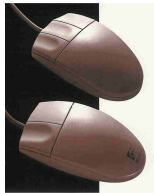
1994 Logitech S34