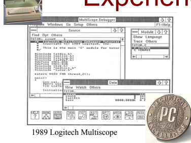
1989 Logitech Multiscope